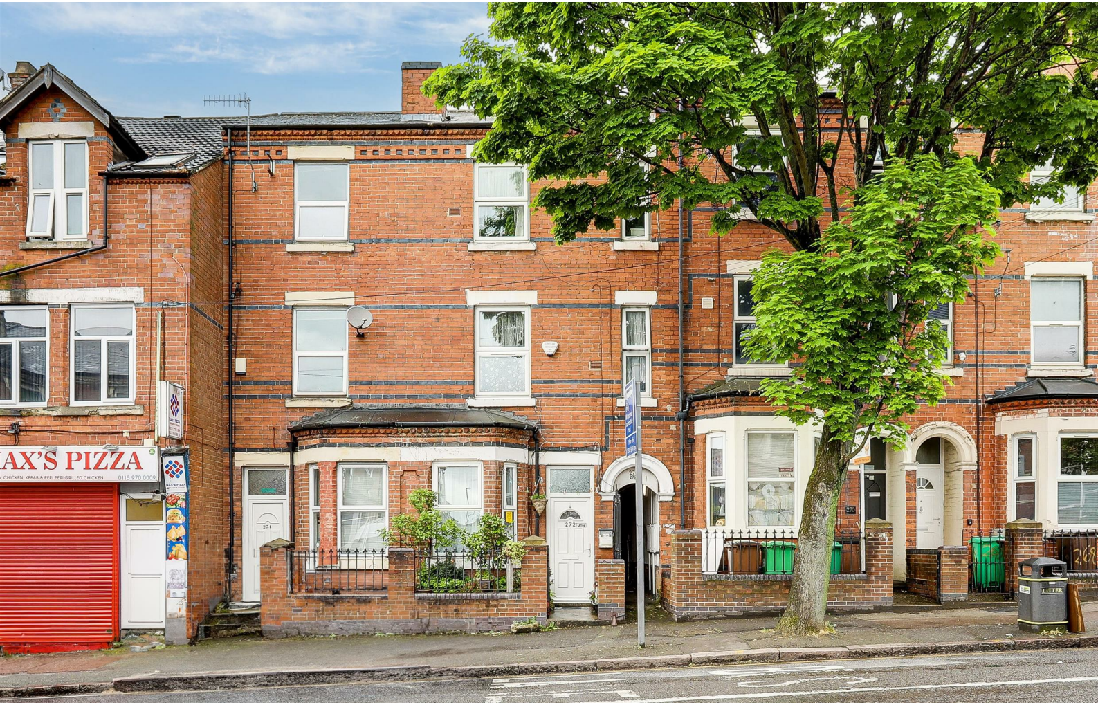
Alfreton Road, Nottingham, Nottinghamshire NG7 5LS