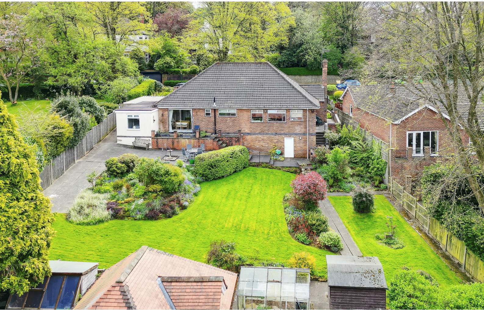
Victoria Crescent, Sherwood, Nottinghamshire NG5 4DA