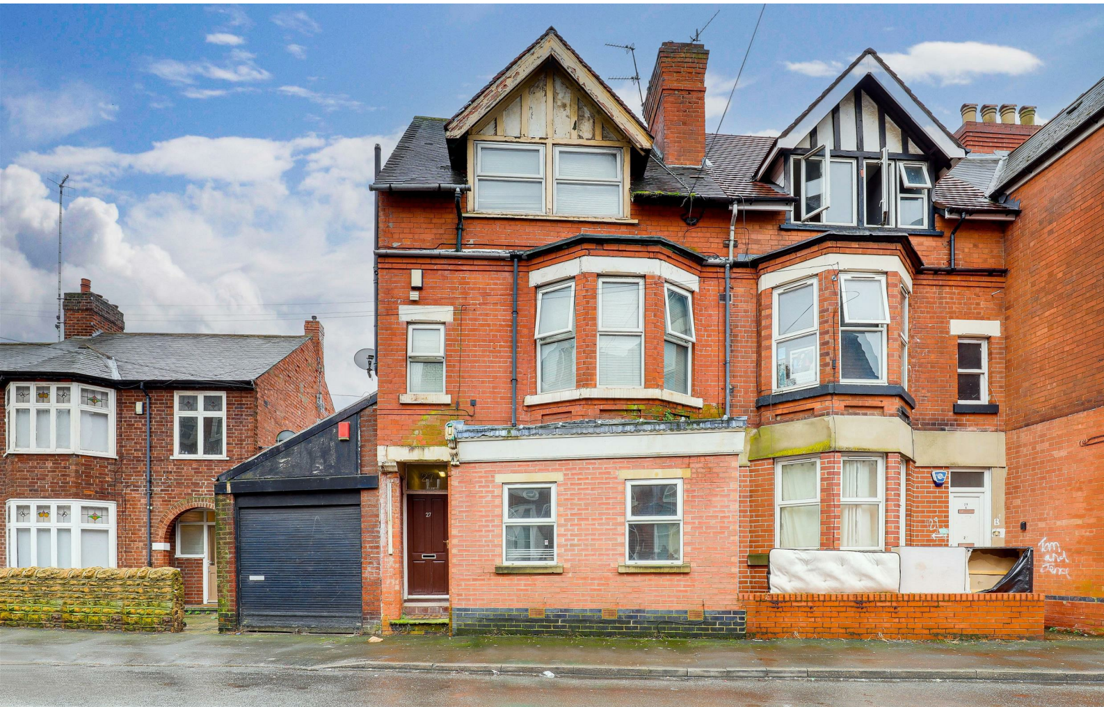
Berridge Road, Forest Fields, Nottinghamshire NG7 6LX