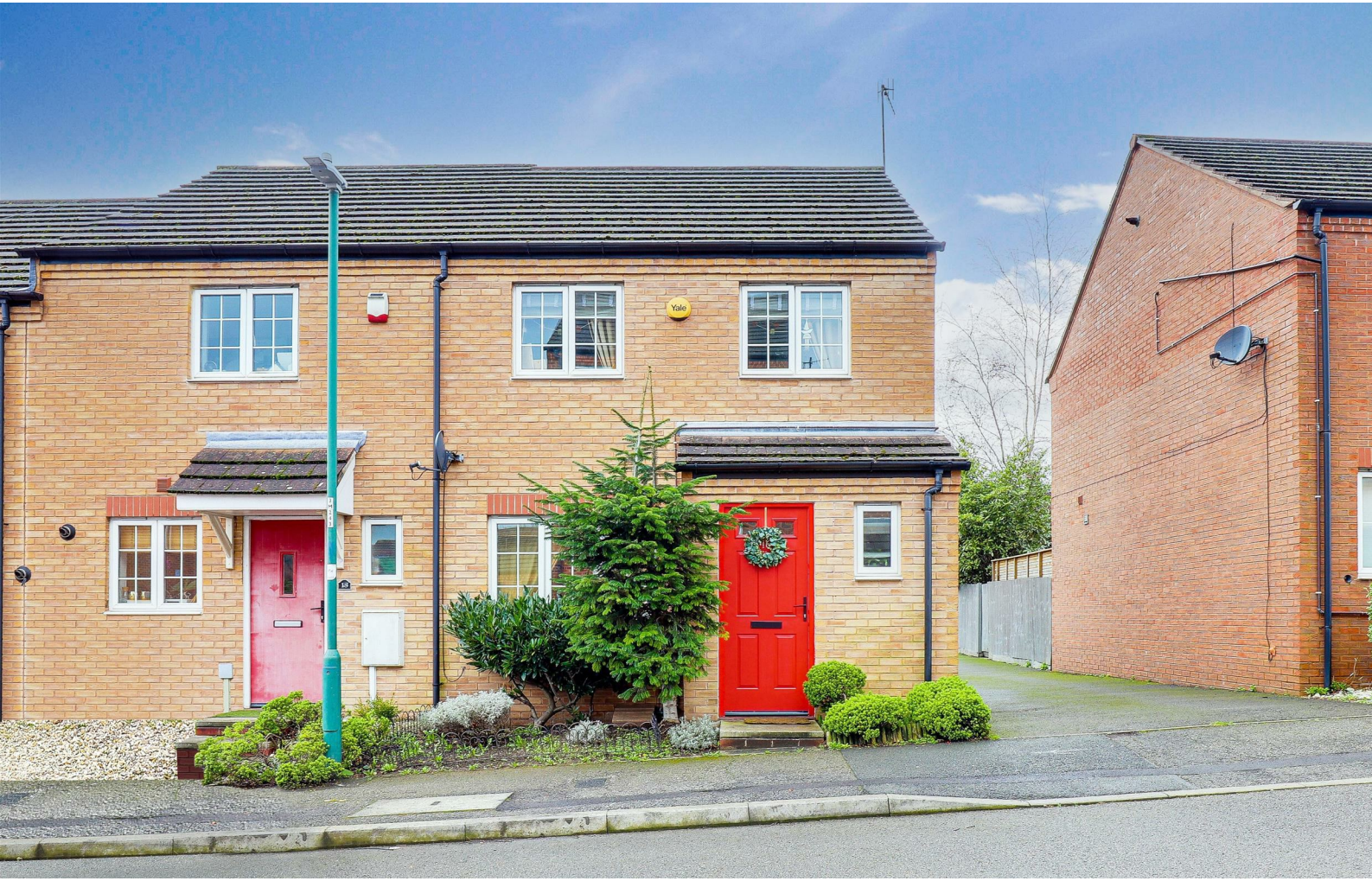
Millidge Close, Bestwood, Nottinghamshire NG5 5UU