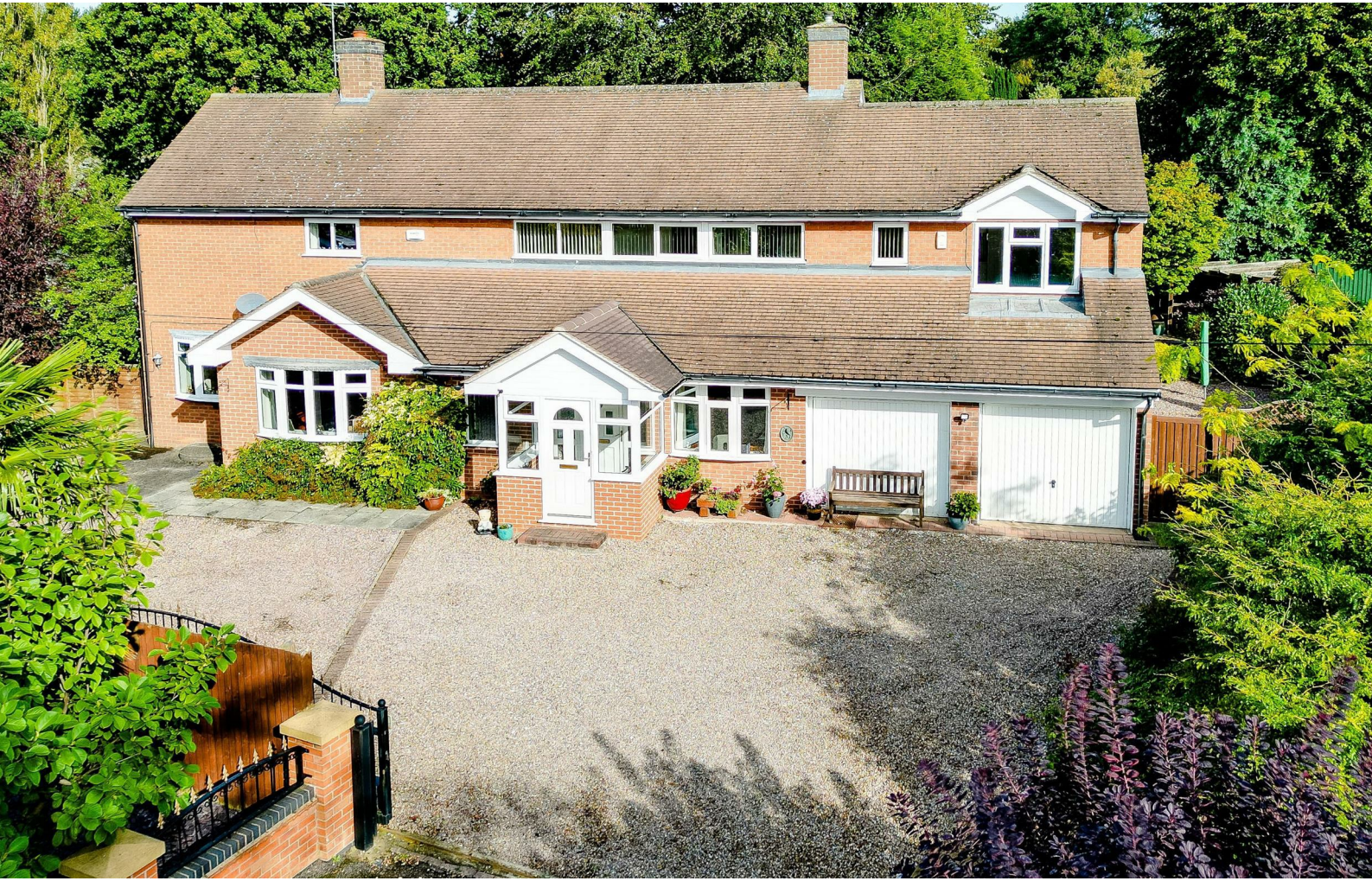
Birch Lea, Redhill, Nottinghamshire NG5 8LT