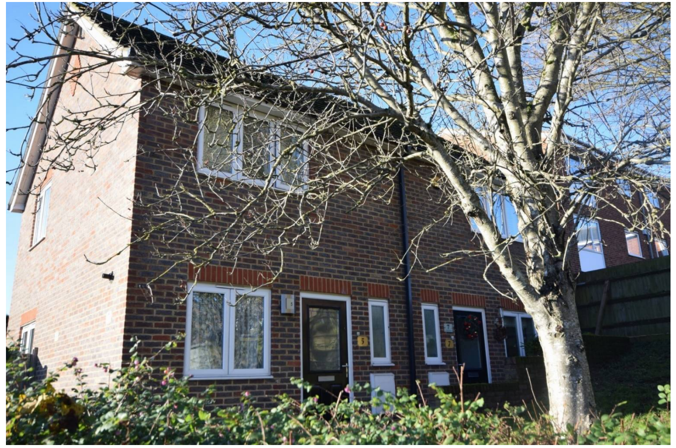
Lakeside Place, London Colney, St Albans, Herts, AL2

Situated in a GREAT LOCATION for LAKESIDE WALKS, within easy reach of LOCAL SHOPS and with EXCELLENT ROAD AND TRANSPORT LINKS, this TWO BEDROOM SEMI-DETACHED home is well presented throughout. Benefitting from TWO ALLOCATED PARKING spaces and a SUNNY ASPECT REAR GARDEN, this property MUST BE VIEWED!