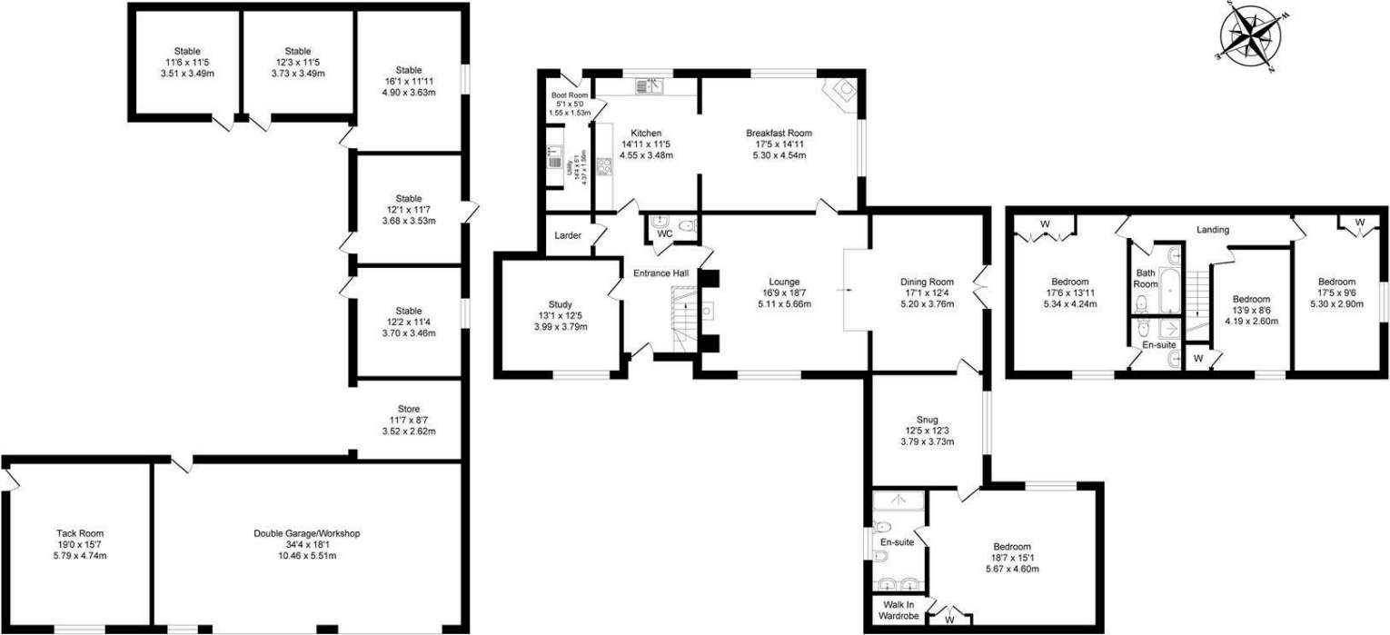
Equestrian Space Approx. Floor Area 1781 Sq.Ft (165.5 Sq.M.)

Surveyed and drawn by Lens Media for illustrative purposes only. Not to scale. Whilst every attempt was made to ensure the accuracy of the floor plan, all measurements are approximate and no responsibility is taken for any error.