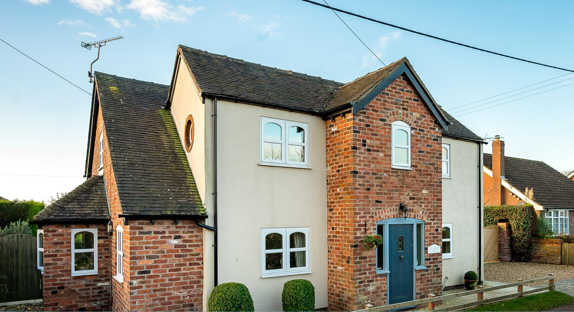
Brookfield View Hankelow | Cheshire