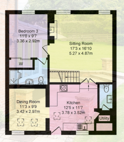
Peckforton Ground Floor Approx. Floor Area 774 Sq.Ft (71.9 Sq.M.)