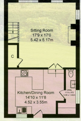
Beeston Retreat Ground Floor Approx. Floor Area 517 Sq.Ft (48.0 Sq.M.)