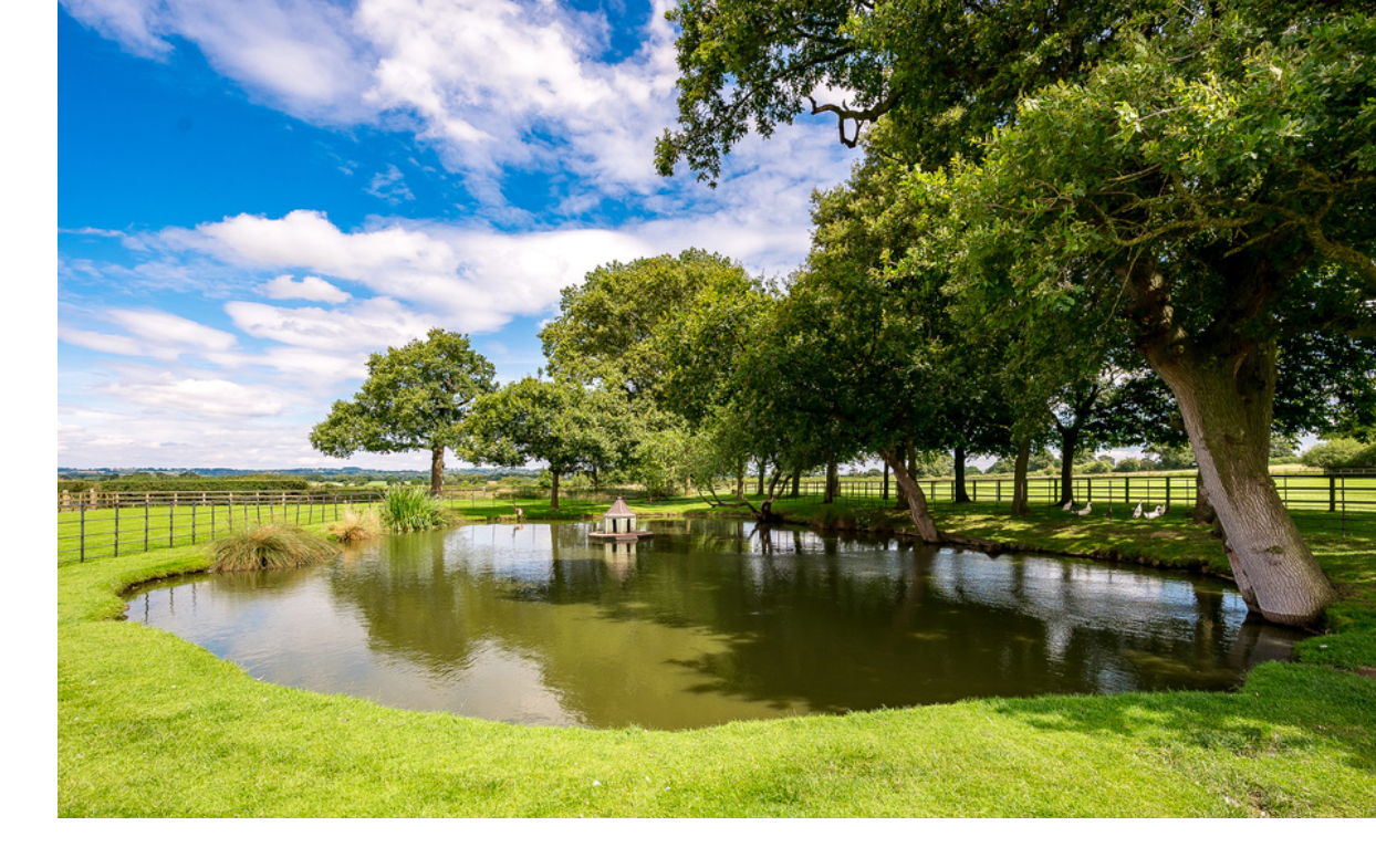
"Breath-taking views of both Peckforton & Beeston Castles"

The gardens are a real feature with manicured level lawns, encompassed by well stocked herbaceous borders. The gardens wrap around three elevations with the principal lawns facing south and eastly. The garden room enjoys castle views with a wide stone terrace abutting the house. A gate leads from the formal lawns to an orchard area then onto a paddock where the timber stables lie. Behind the paddock land to the east is a small lake with a timber pod overlooking with wooden dell in the corner of this tranquil area. There is also a wide stone terrace to the rear of the house which overlooks the gravelled area with parking for numerous cars. Also to the rear is a wonderful lake with central island and duck house.