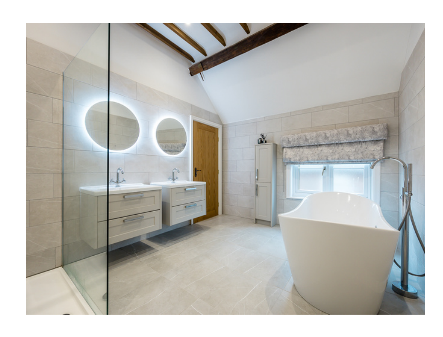
"An outstanding specification with a no expense mantra evident throughout"