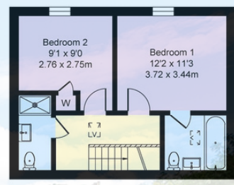
Bolesworth First Floor Approx. Floor Area 401 Sq.Ft (37.3 Sq.M.)