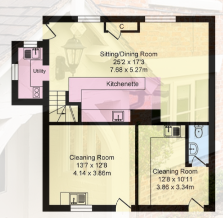
Shepherds Rest Ground Floor Approx. Floor Area 769 Sq.Ft (71.4 Sq.M.)