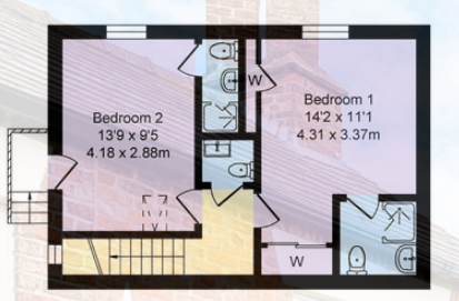
Shepherd's Rest First Floor Approx. Floor Area 423 Sq.Ft (39.3 Sq.M.)