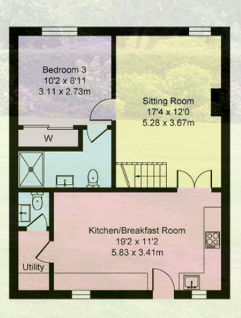
Bolesworth Ground Floor Approx. Floor Area 672 Sq.Ft (62.4 Sq.M.)