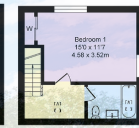
Beeston Retreat First Floor Approx. Floor Area 301 Sq.Ft (28.0 Sq.M.)