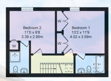
Peckforton First Floor Approx. Floor Area 453 Sq.Ft (42.1 Sq.M.)