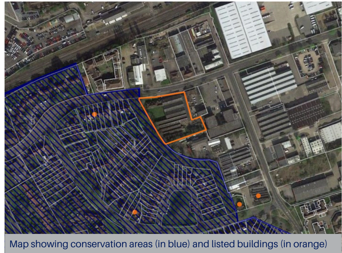
Map showing conservation areas (in blue) and listed buildings (in orange)

TOPOGRAPHY: A copy of the Topographical Survey is available upon request