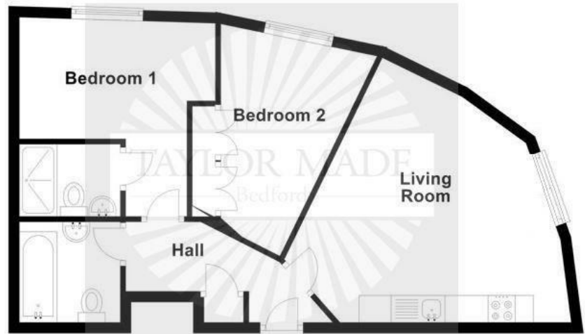
This floor plan is for illustrative purposes only. The total size is approximate. Plan produced using PlanUp.

Bedford town centre has a great selection of shops, bars & restaurants. The train station, located just outside of the town centre, offers fantastic transport links into Luton in 20 minutes and London St Pancras in under 40 minutes. The road links from Bedford also serve commuters well with direct access to the A428, the M114 and 13.