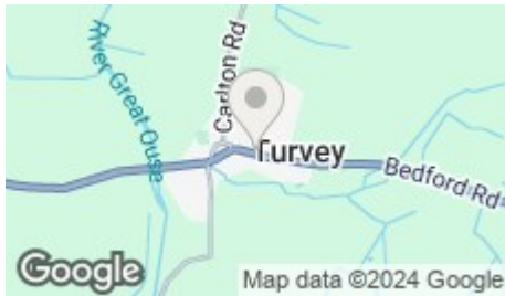
2 Laws Mansion Courtyard, Turvey, MK43 8DB