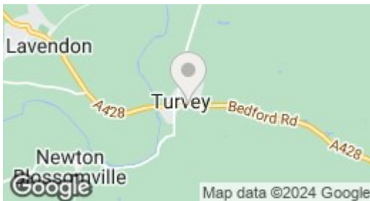
Plot 11, 4 Laws Close, Turvey, MK43 8DB