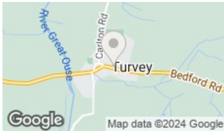
2 Laws Mansion Courtyard, Turvey, MK43 8DB