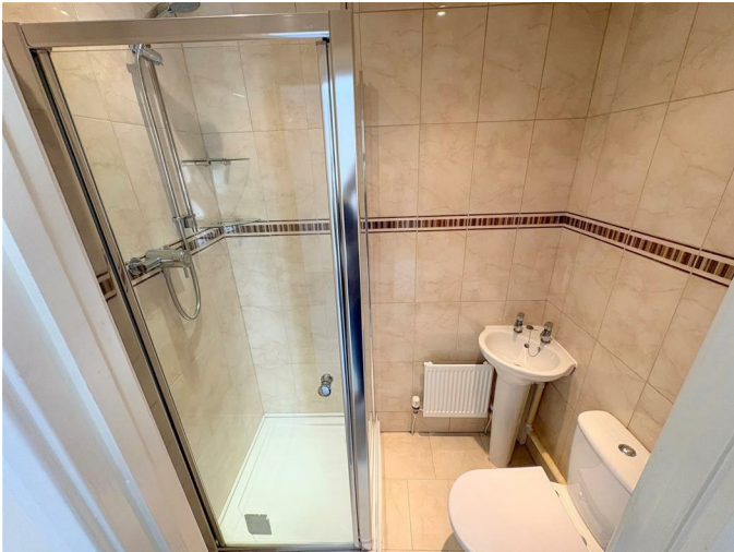
En-suite Shower Room 5'6" x 3'8" (1.69 x 1.13)

Skimmed ceiling with spotlights, tiled walls, tiled flooring, radiator, three piece suite comprising a corner shower cubicle, corner wash hand basin and a low level W.C.