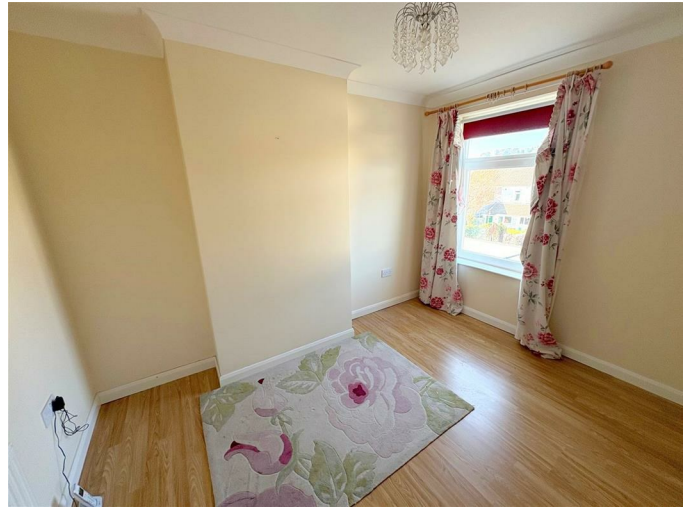
Bedroom Two 11'0" x 8'7" (3.37 x 2.63)

Skimmed and coved ceiling, skimmed walls, wood effect laminate flooring, radiator, uPVC double glazed window to the rear.