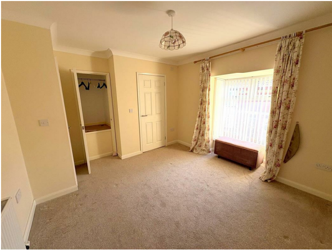
Bedroom One 10'10" x 10'7" (3.31 x 3.25)

Skimmed and coved ceiling, skimmed walls, fitted carpet, radiator, built-in storage / wardrobe space, uPVC double glazed box window to the front, door into:-