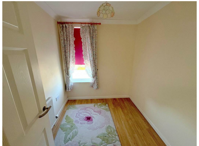
Bedroom Three 7'10" x 7'1" (2.39 x 2.16)

Skimmed and coved ceiling, skimmed walls, wood effect laminate flooring, radiator, uPVC double glazed window to the rear.