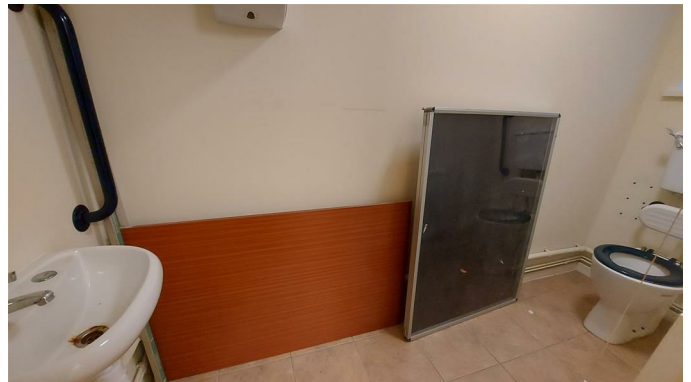
W.C 9'10" x 3'3" (3.0 x 1.0)

Skimmed ceiling and walls, tiled flooring, radiator, uPVC double glazed window with obscured glass to side and a two piece suite comprising a low level W.C and wall mounted wash hand basin.