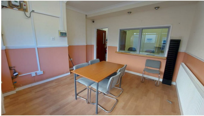
Trading Area 13'1" x 11'5" (4.0 x 3.5)

Entry via glazed door. Skimmed and coved ceiling, skimmed walls, wood effect vinyl flooring, radiator, large shopfront window, security window looking into office and door to: