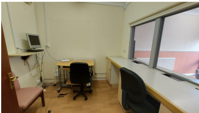
Office 8'10" x 8'6" (2.7 x 2.6)

Skimmed and coved ceiling, skimmed walls, wood effect vinyl flooring and radiator.