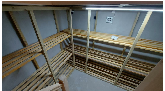
Basement 9'10" x 8'6" (3.0 x 2.6)

Concrete walls and floor, fitted with wooden storage racks.