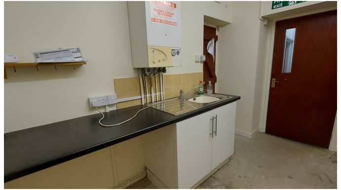
Staff Kitchen 11'5" x 5'6" (3.5 x 1.7)

Skimmed and coved ceiling, skimmed walls, radiator, a range of base units with a complementary work surface housing a stainless steel sink/drain, wall mounted gas combination boiler, door to rear, door to lower ground floor and door to: