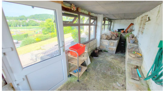
Basement 27'10" x 6'6" (8.5 x 2.0)

An area previously used as a potting shed, three uPVC double glazed windows and door to the rear and door to a further storage area with restricted height.