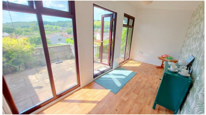
Summer House 15'5" x 6'2" (4.7 x 1.9)

Pvc panelled ceiling and walls, wood effect vinyl flooring, two full length uPVC double glazed windows and Upvc double glazed french doors to patio.