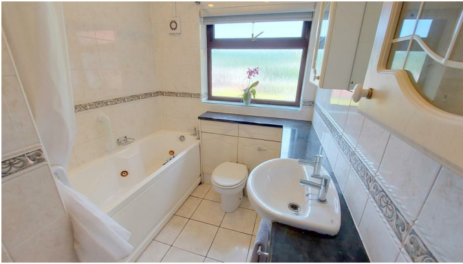
Bathroom 8'6" x 6'2" (2.6 x 1.9)

Papered ceiling with spotlights, tiled walls and floor, a three piece suite comprising a panel bath with shower over, fitted cupboards housing a low level W.C with concealed cistern and wash hand basin, uPVC double glazed window with obscured glass to rear.