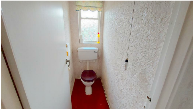
W.C 5'6" x 2'7" (1.7 x 0.8)

Textured ceiling, skimmed walls, tiled floor, window to the rear and a low level W.C.