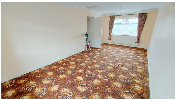
Bedroom One 21'3" x 10'5" (6.5 x 3.2 )

Textured and covered ceiling, skimmed walls, fitted carpet, two radiators, dual aspect uPVC double glazed windows to the front and rear. Has the potential to be split into two bedrooms.