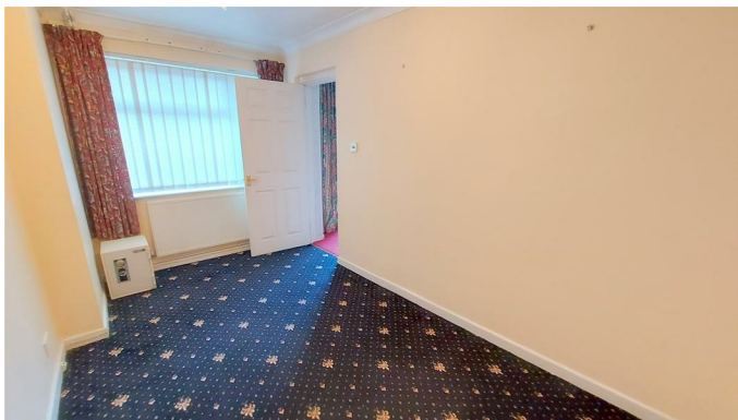
Reception Room Two 12'9" x 7'6" (3.9 x 2.3)

Textured and covered ceiling, skimmed walls, fitted carpet, radiator, uPVC double glazed window to front.