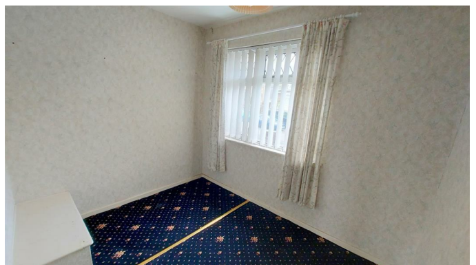
Bedroom Four 8'10" x 6'10" (2.7 x 2.1 )

Skimmed ceiling, papered walls, fitted carpet, radiator, uPVC double glazed window to the front.