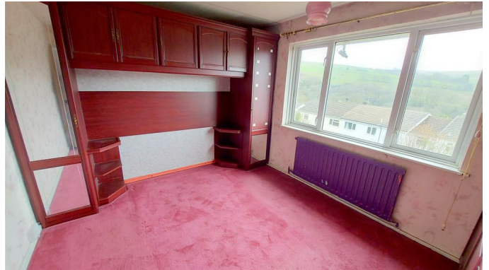
Bedroom Two 11'9" x 9'10" (3.6 x 3.0)

Textured ceiling, papered walls, fitted carpet, radiator, fitted wardrobes, uPVC double glazed window to the rear.