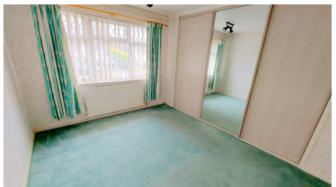
Bedroom Three 12'1" x 11'1" (3.7 x 3.4 )

Skimmed ceiling, papered walls, fitted carpet, radiator, fitted wardrobes, uPVC double glazed window to the front.