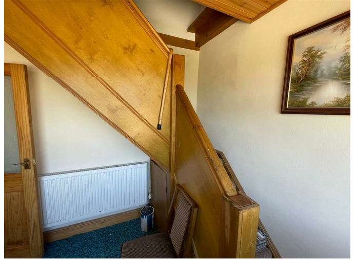
Study 8'11" x 7'7" (2.72m x 2.31m)

Wood paneled ceiling, skimmed walls, tiled flooring, radiator, carpeted stairs to the first floor, under stairs storage cupboard, uPVC double glazed window to the rear