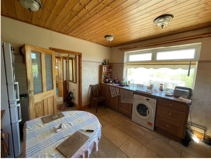
Kitchen / Diner 9'11" x 12' (3.02m x 3.66m)

Wood paneled ceiling, part skimmed and part tiled walls, tiled flooring, radiator, a range of base and wall mounted units with a complementary work surface housing a stainless steel sink / drainer, space for range cooker, space for fridge/freezer, space and plumbing for a washing machine, cupboard housing the gas combination boiler, uPVC double glazed window to the rear, wooden double glazed door to the side