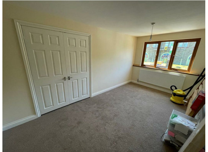
Master Bedroom 8'1" x 15'7" (2.46m x 4.75m)

Skimmed ceiling, skimmed walls, fitted carpet, radiator, built-in walk in wardrobe, uPVC double glazed windows to the front, door into:-