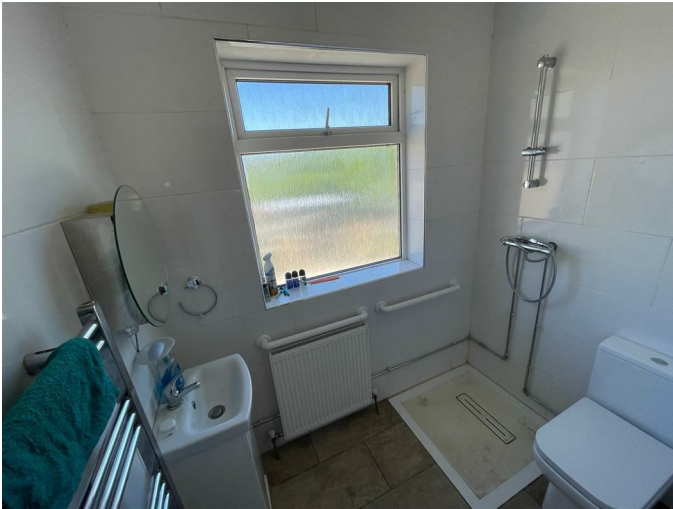
Shower Room 4'5" x 6'6" (1.35m x 1.98m)

Tiled walls, tiled flooring, radiator, chrome heated towel rail, three piece suite comprising a shower tray, wash hand basin and a low level W.C., uPVC double glazed window with obscured glass to the rear