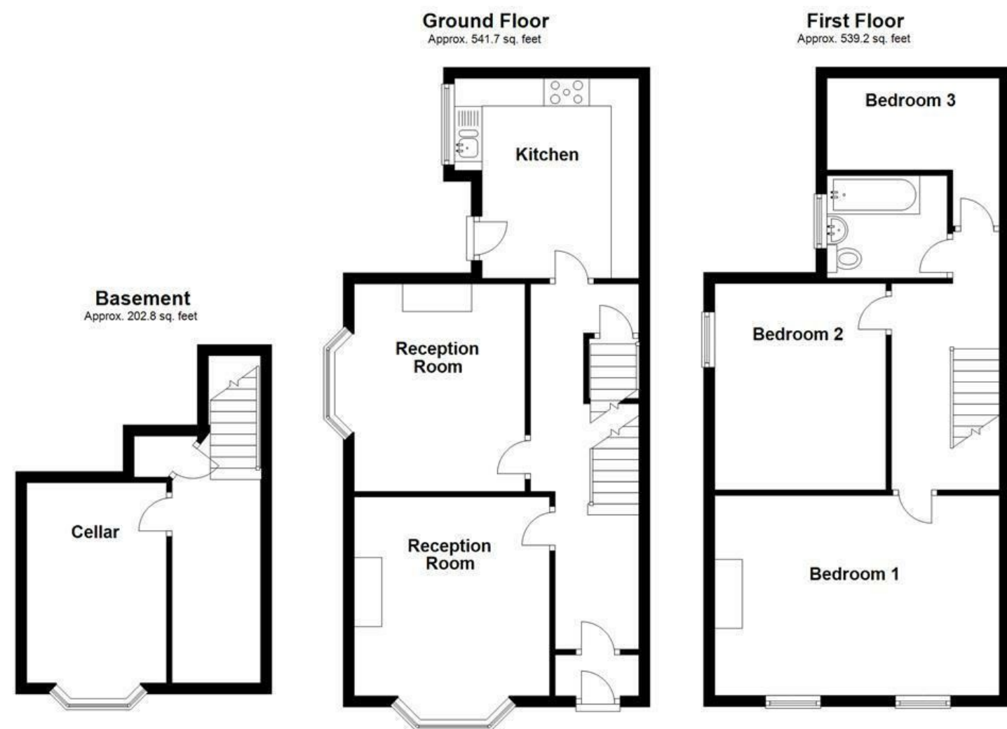
All floorplans are for guidance only. Not to scale. Please check all dimensions and shapes before making any decisions reliant upon them. Plan produced using PlanUp.