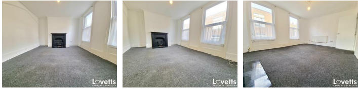
Living Room 12'02x15'39 (3.71mx4.57m)