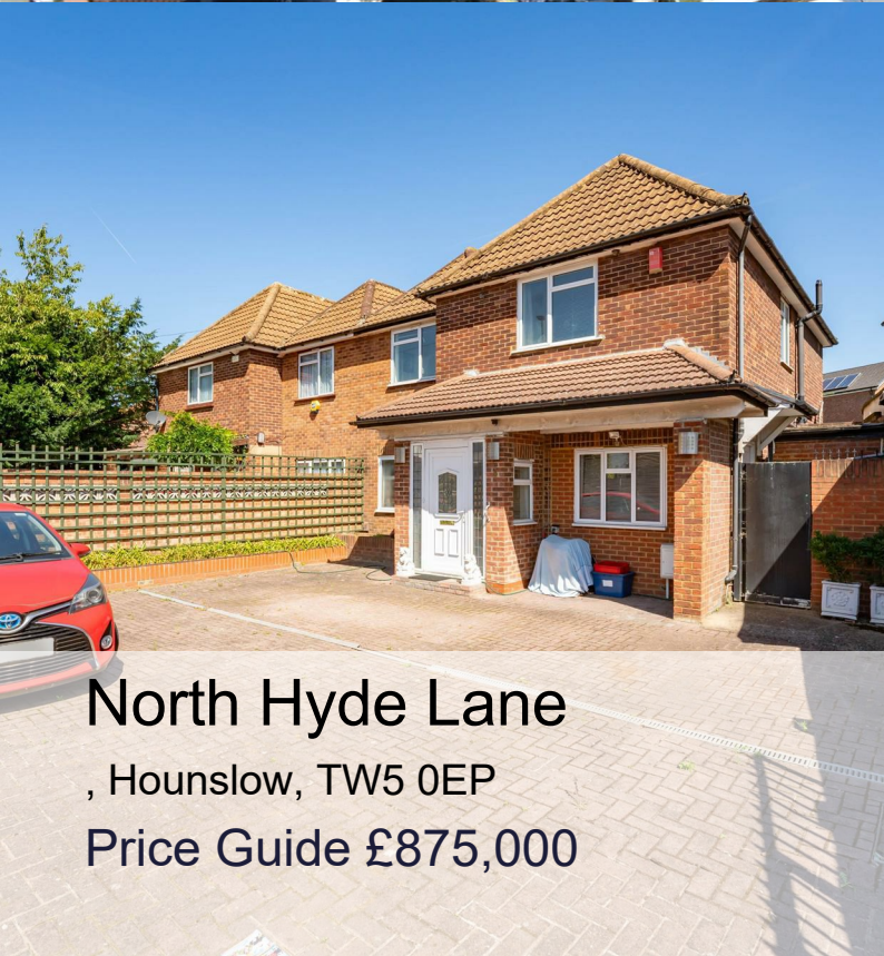
North Hyde Lane , Hounslow, TW5 0EP Price Guide £875,000