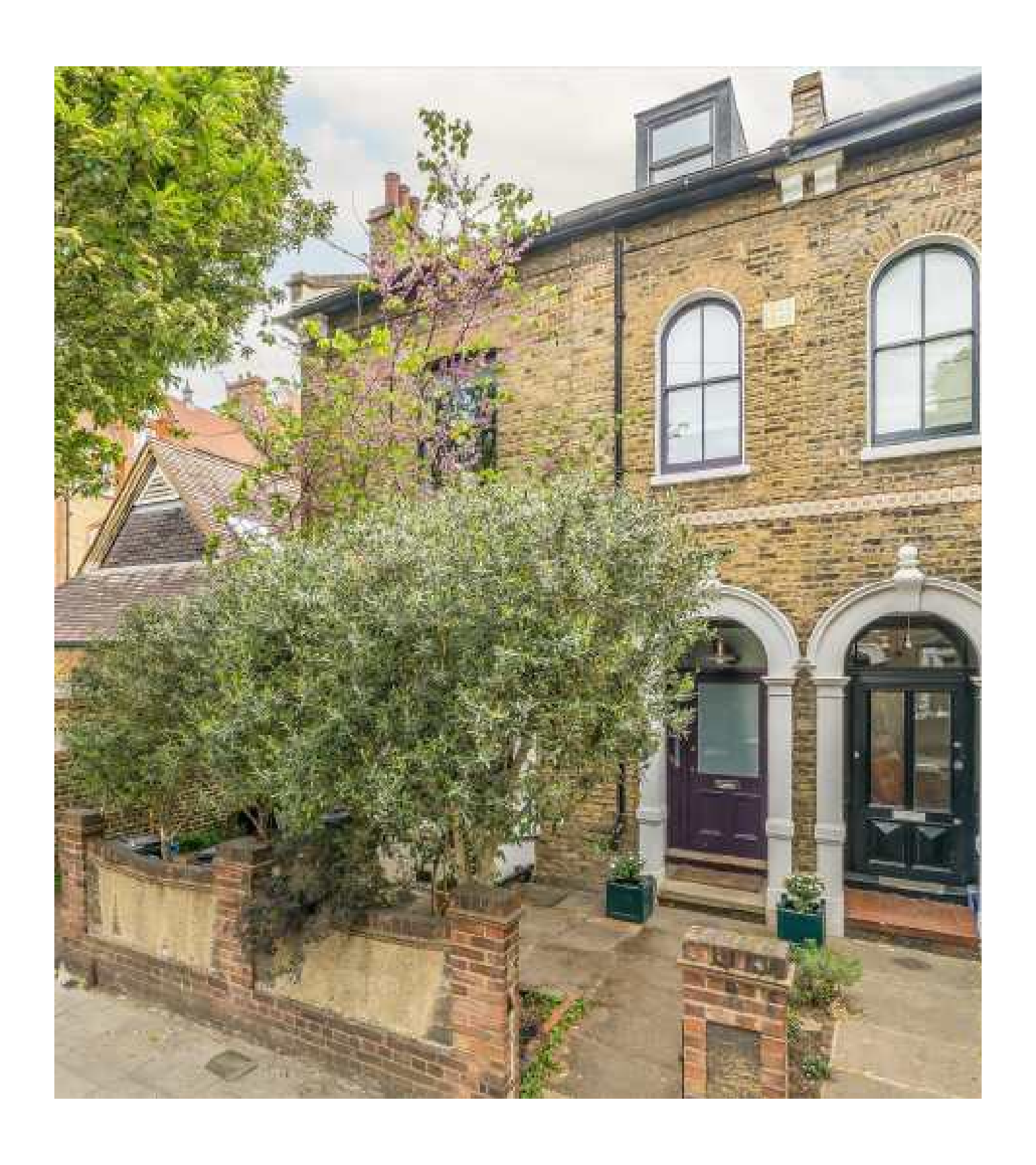
Elrington Road, E8 £3,000,000