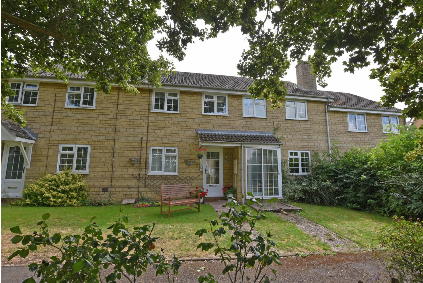
27 Pinfold Close, South Luffenham, Rutland, LE15 8NE