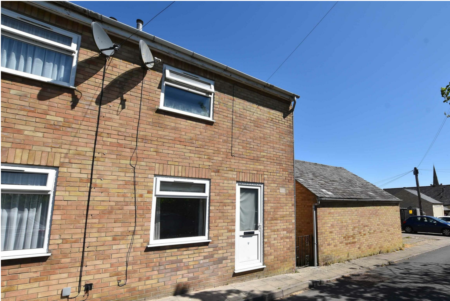
21 Rock Road, Stamford, PE9 2PT