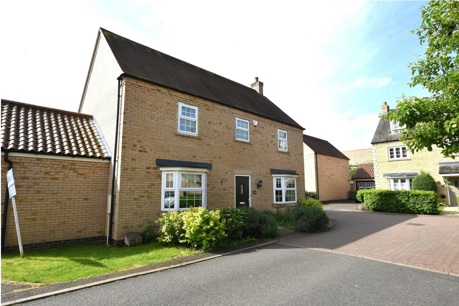
1 Paynes Field, Barnack, PE9 3BG