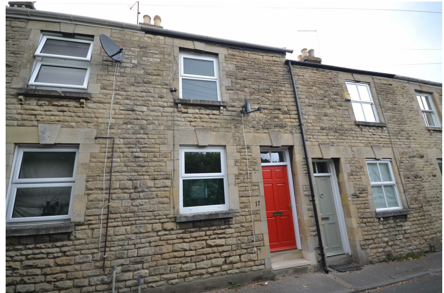
17 Rock Road, Stamford, Lincolnshire, PE9 2PT