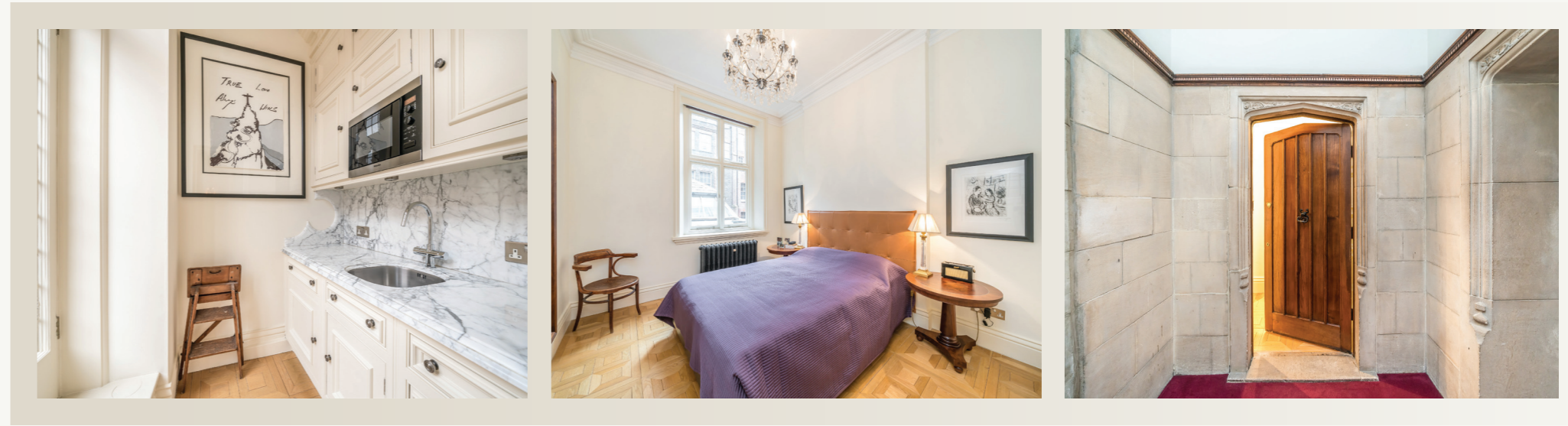
South Audley Street Views

South Audley Street is perfectly located for the various boutiques, restaurants, and hotels of central Mayfair. It runs between Grosvenor Square and Curzon Street and is opposite Grosvenor Chapel with world renowned Harry's Bar on your doorstep.