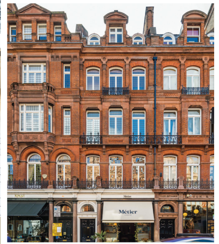
SOUTH AUDLEY STREET MAYFAIR, WIK