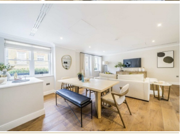
LOCATED OFF BERKELEY SQUARE, THIS BRAND NEWLY RENOVATED TWO BEDROOM MEWS APARTMENT HAS BEEN REFURBISHED TO AN EXCELLENT STANDARD THROUGHOUT.