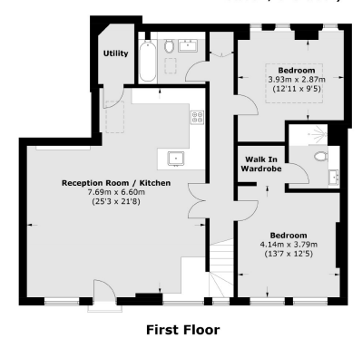
Total area (approx.): 109.4 sq. m (1,177.6 sq. ft) Garage area (approx.): 37.4 sq. m (402.6 sq. ft)