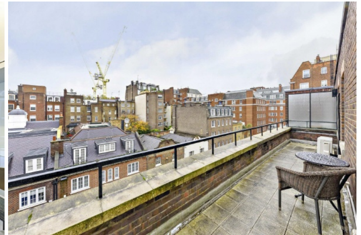
Park Mount Lodge, Reeves Mews, W1K Approximate Gross Internal Area 92.45 sq m / 995 sq ft