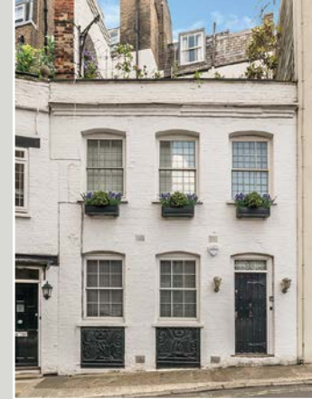
Mews House Front Exterior