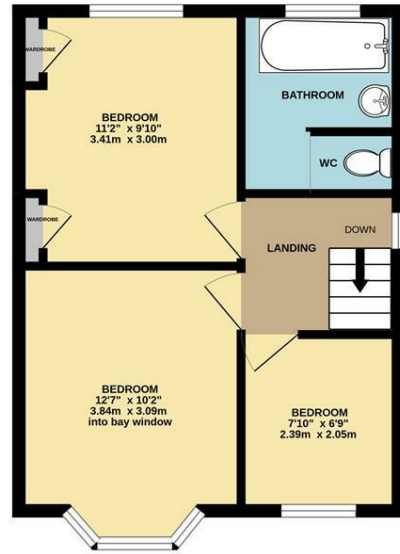
1ST FLOOR 414 sq.ft. (38.5 sq.m.) approx.