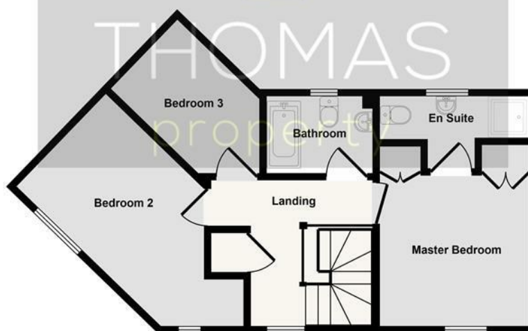
First Floor Approx 46 sq m / 495 sq ft

This floorplan is only for illustrative purposes and is not to scale. Measurements of rooms, doors, windows, and any items are approximate and no responsibility is taken for any error, omission or mis-statement. Icons of items such as bathroom suites are representations only and may not look like the real items. Made with Made Snappy 360.