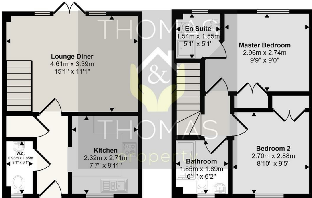
Ground Floor Approx 29 sq m / 312 sq ft

Approx Gross Internal Area 59 sq m / 631 sq ft