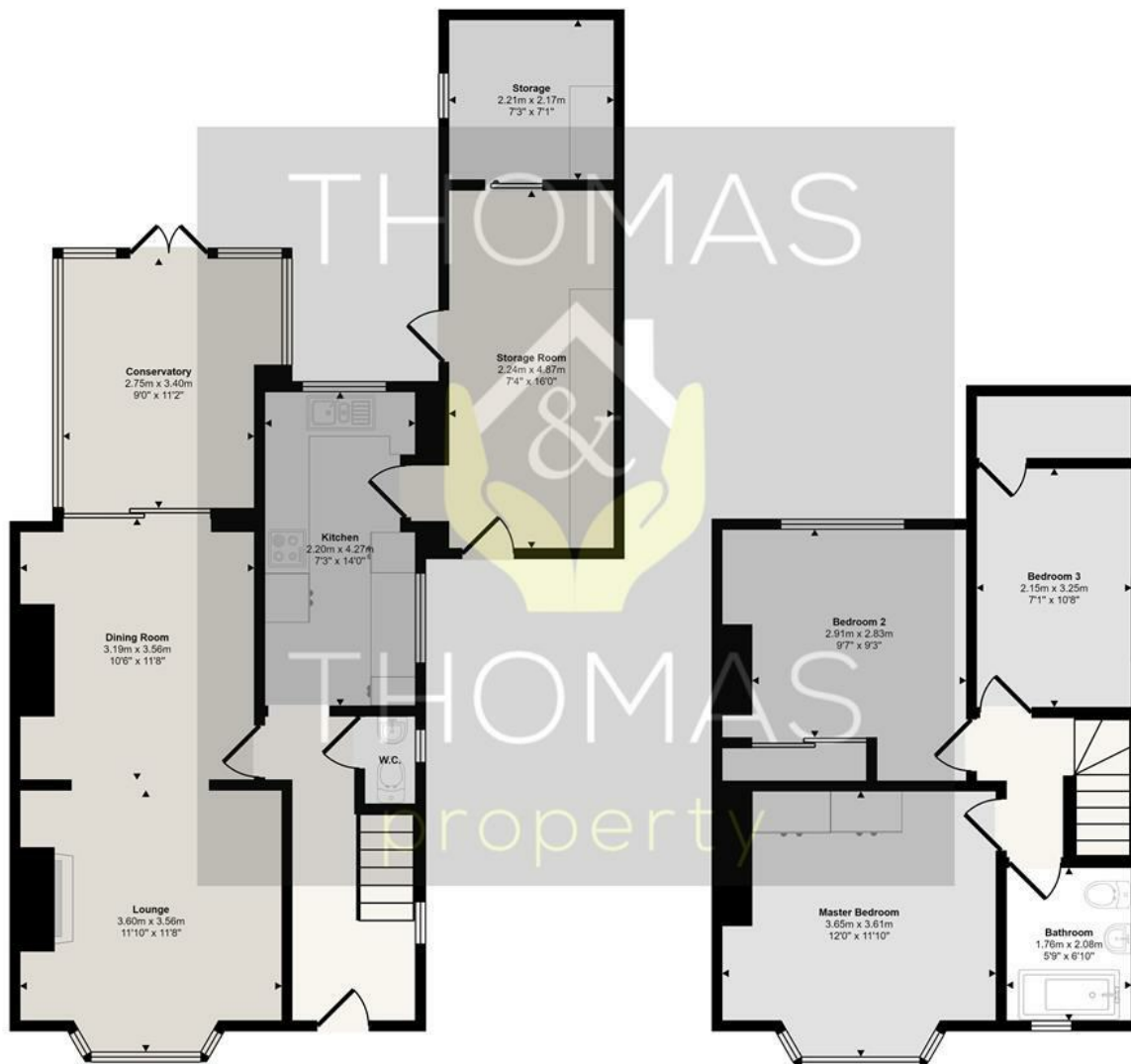
Ground Floor Approx 69 sq m / 738 sq ft

Approx Gross Internal Area 111 sq m / 1190 sq ft