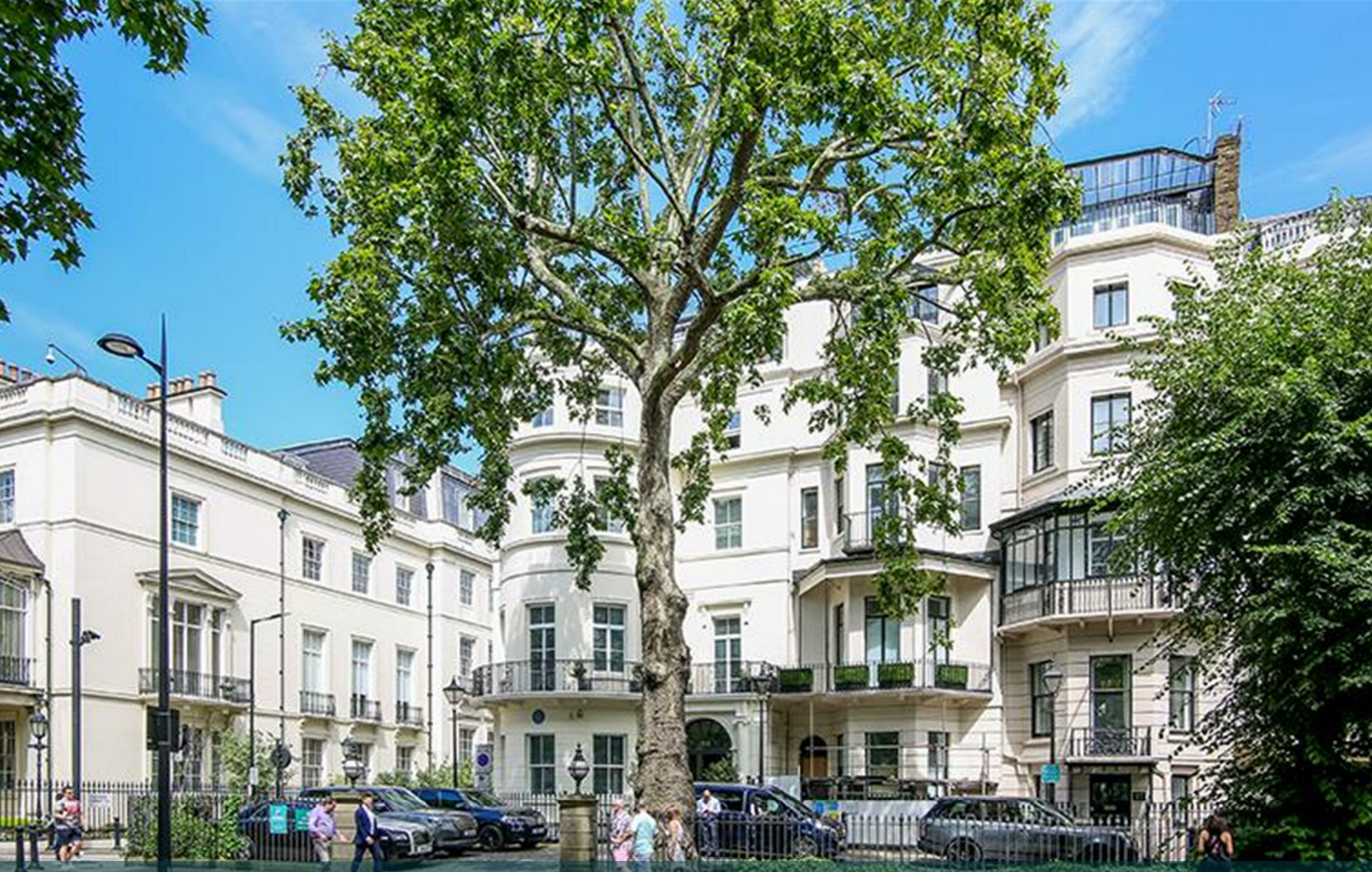
Park Lane, Mayfair, W1K