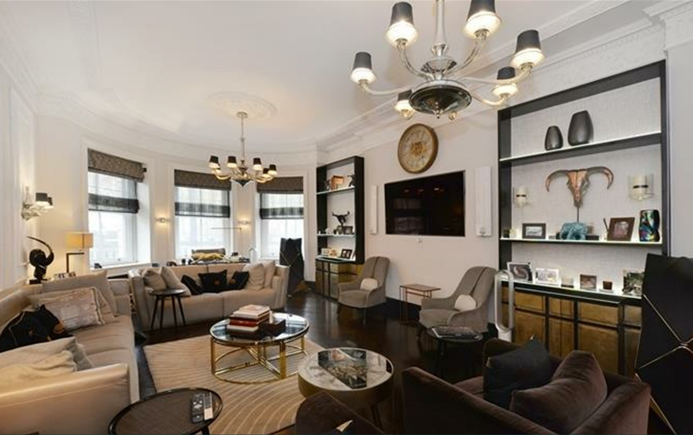
Park Lane, Mayfair, W1K