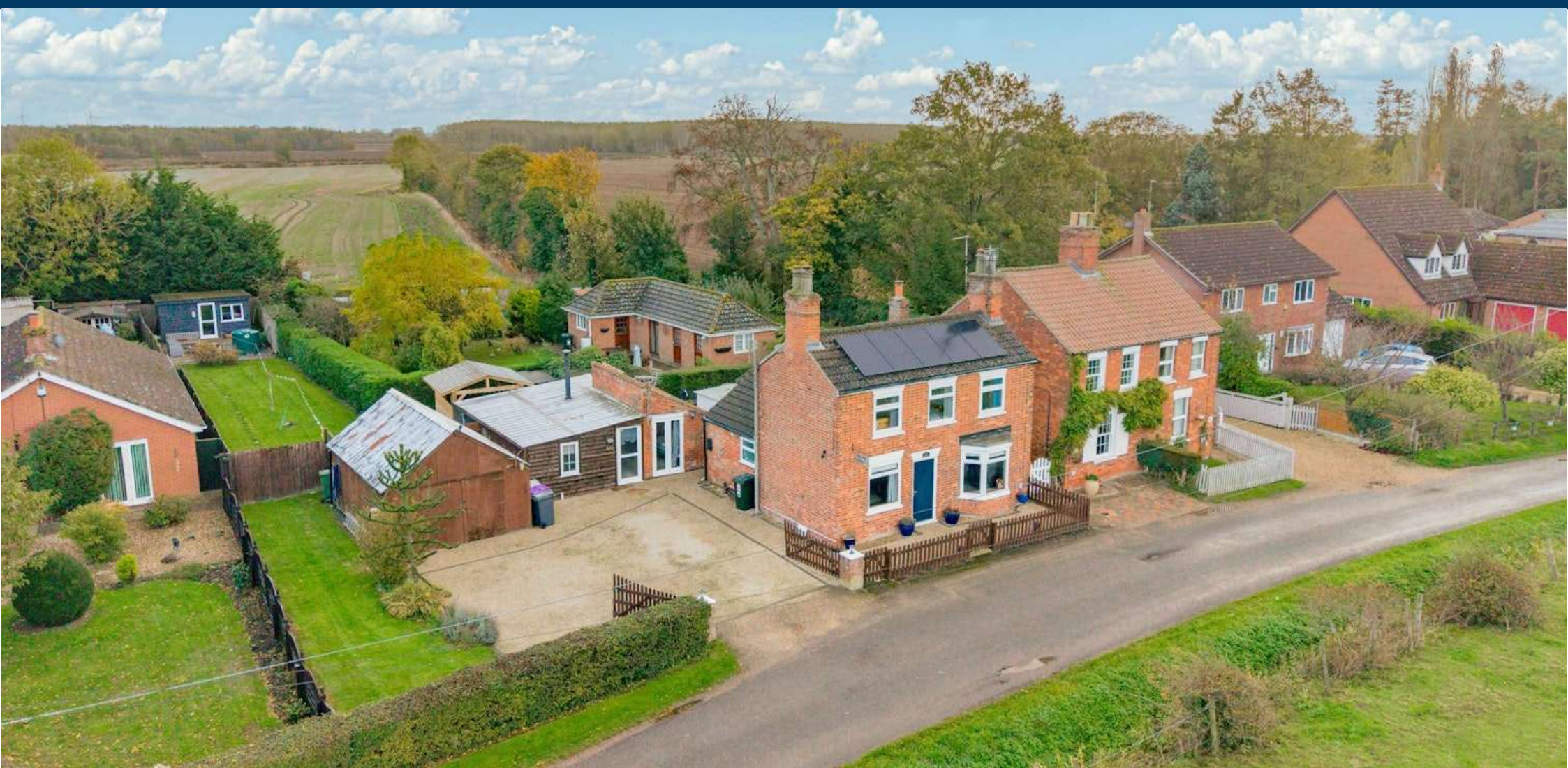
The Old Shop, Firsby, PE23 5QJ