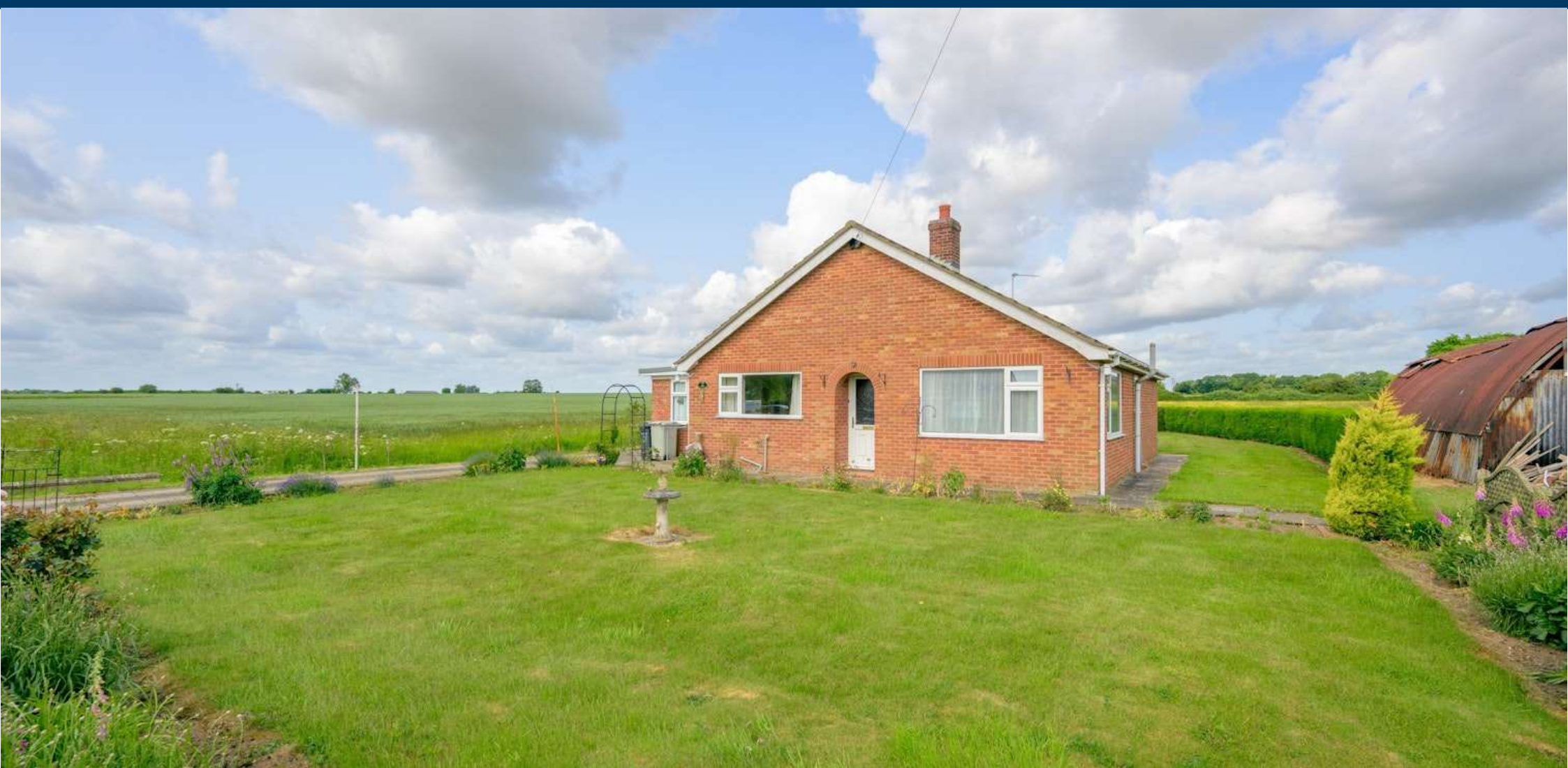
The Conifers, Cul De Sac, Stickford, PE22 8EY