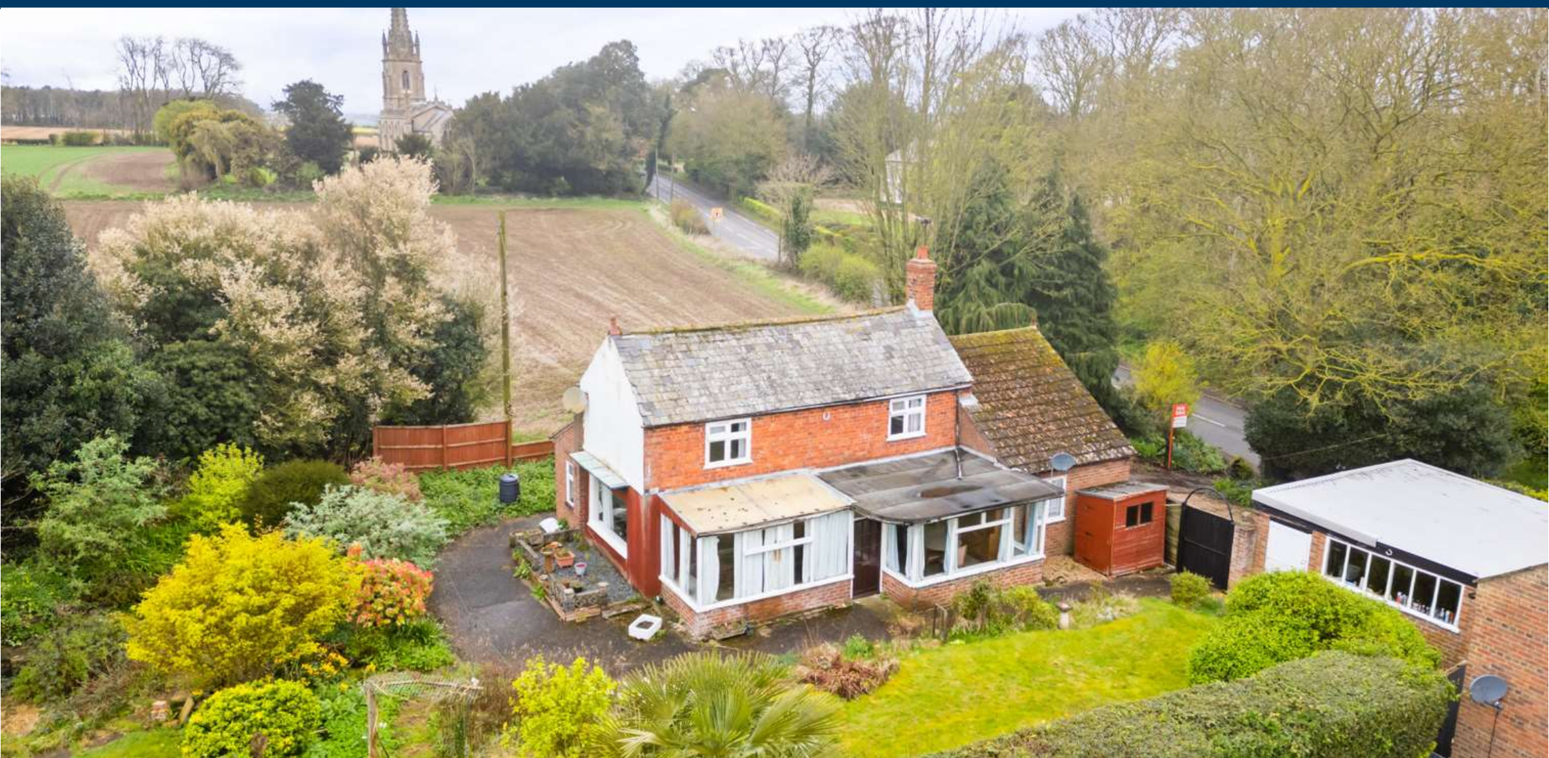
Bannister Cottage, Partney Road, Sausthorpe, PE23 4JL