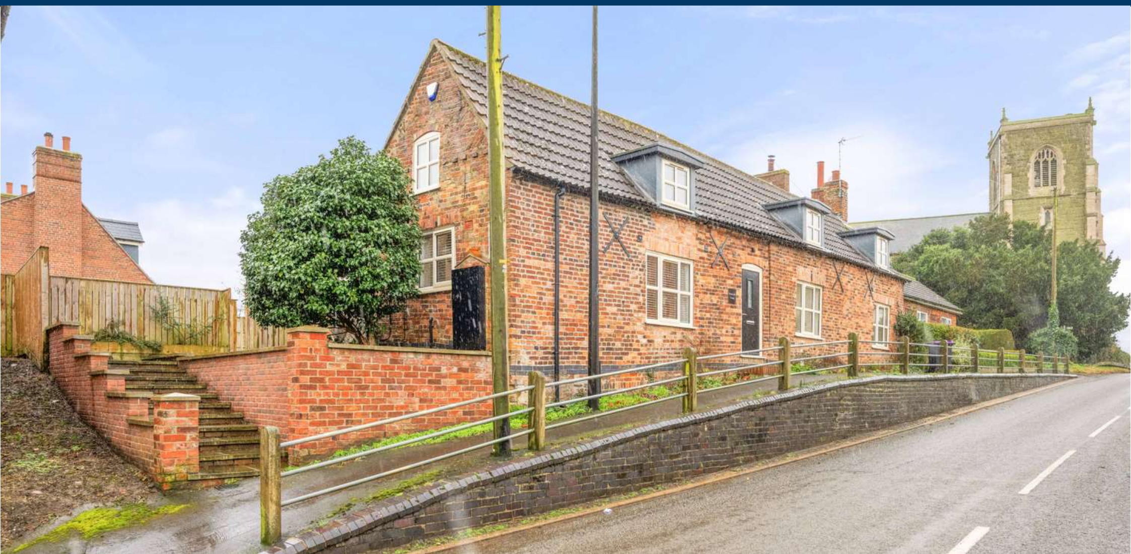
Honeysuckle Cottage, Dalby Road, Partney, PE23 4PQ