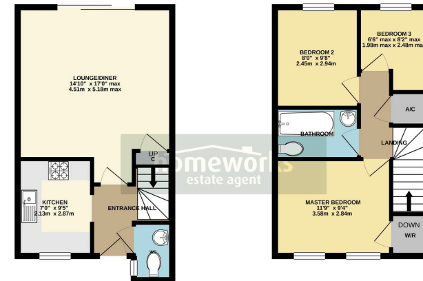
1ST FLOOR 353 sq.ft. (32.8 sq.m.) approx.

TOTAL FLOOR AREA: 714 sq.ft. (66.4 sq.m.) approx. Whilst every effort has been made to ensure the accuracy of the information contained here, measurements of floor, ceiling, stairs and any other items are approximate and no responsibility is taken for any minor variations or misstatements. The plan is for illustrative purposes only and should be used as a guide only. Prospective purchasers: The services, systems and appliances shown here are not tested and no guarantee can be given for their operation or efficiency can be given. Mark with reference 10000