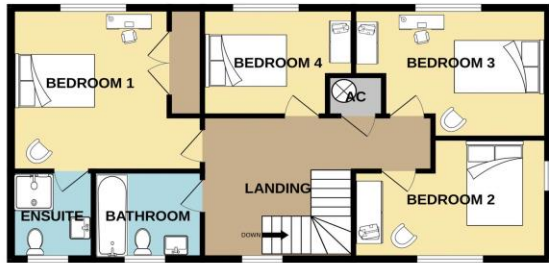
TOTAL FLOOR AREA: 1936 sq.ft. (179.9 sq.m.) approx.

Whilst every attempt has been made to ensure the accuracy of the floorplan contained here, measurements of doors, windows, rooms and any other items are approximate and no responsibility is taken for any error, omission or mis-statement. This plan is for illustrative purposes only and should be used as such by any prospective purchaser. The services, systems and appliances shown have not been tested and no guarantee as to their operability or efficiency can be given. Made with Metropix ©2024