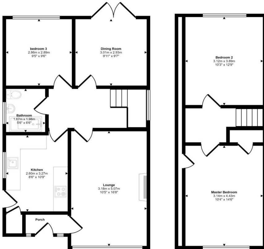
Ground Floor Approx 58 sq m / 627 sq ft

Approx Gross Internal Area 93 sq m / 1001 sq ft