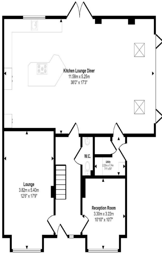
Ground Floor Approx 107 sq m / 1153 sq ft

Approx Gross Internal Area 265 sq m / 2855 sq ft