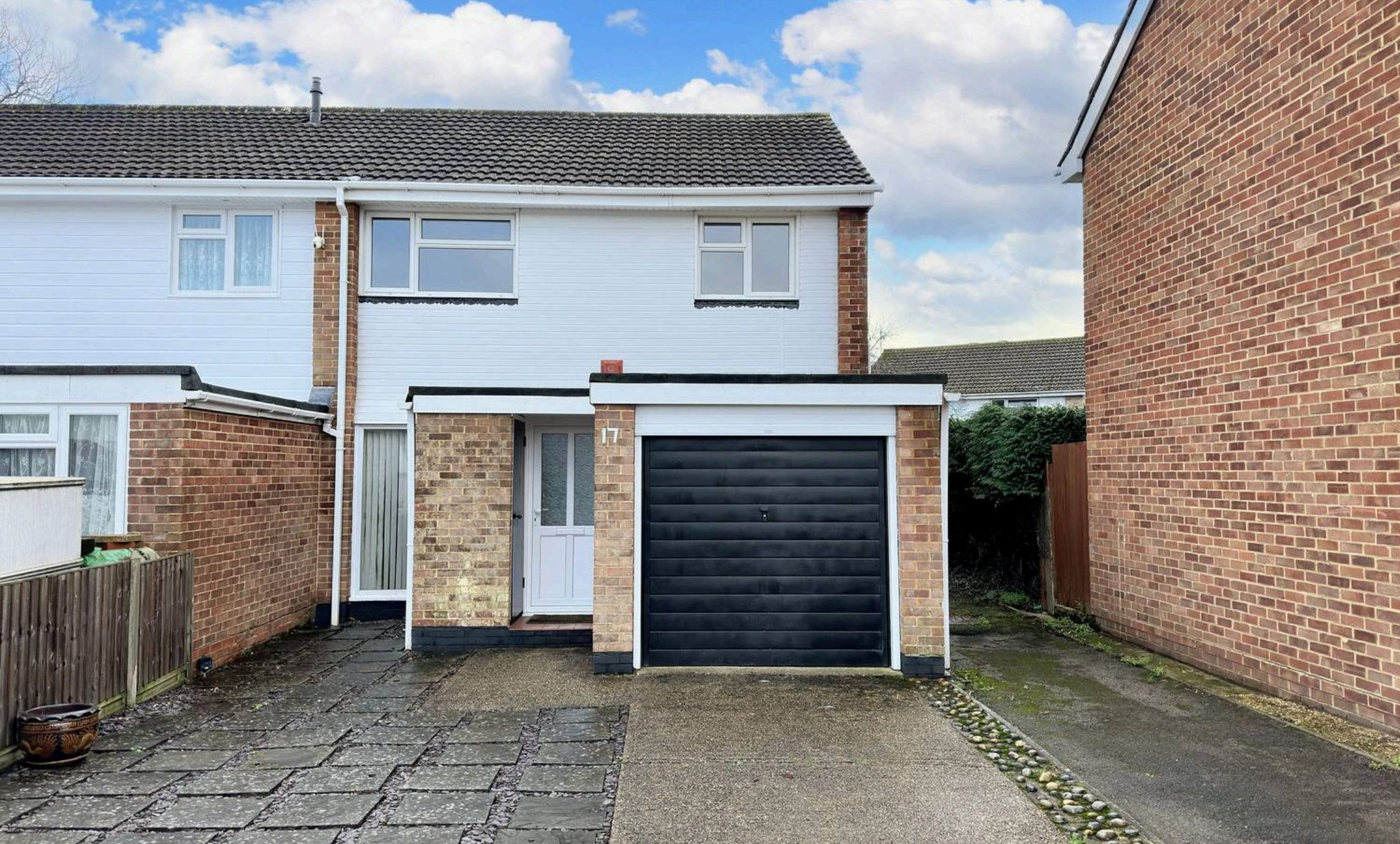
17 Redrise Close, Holbury £260,000