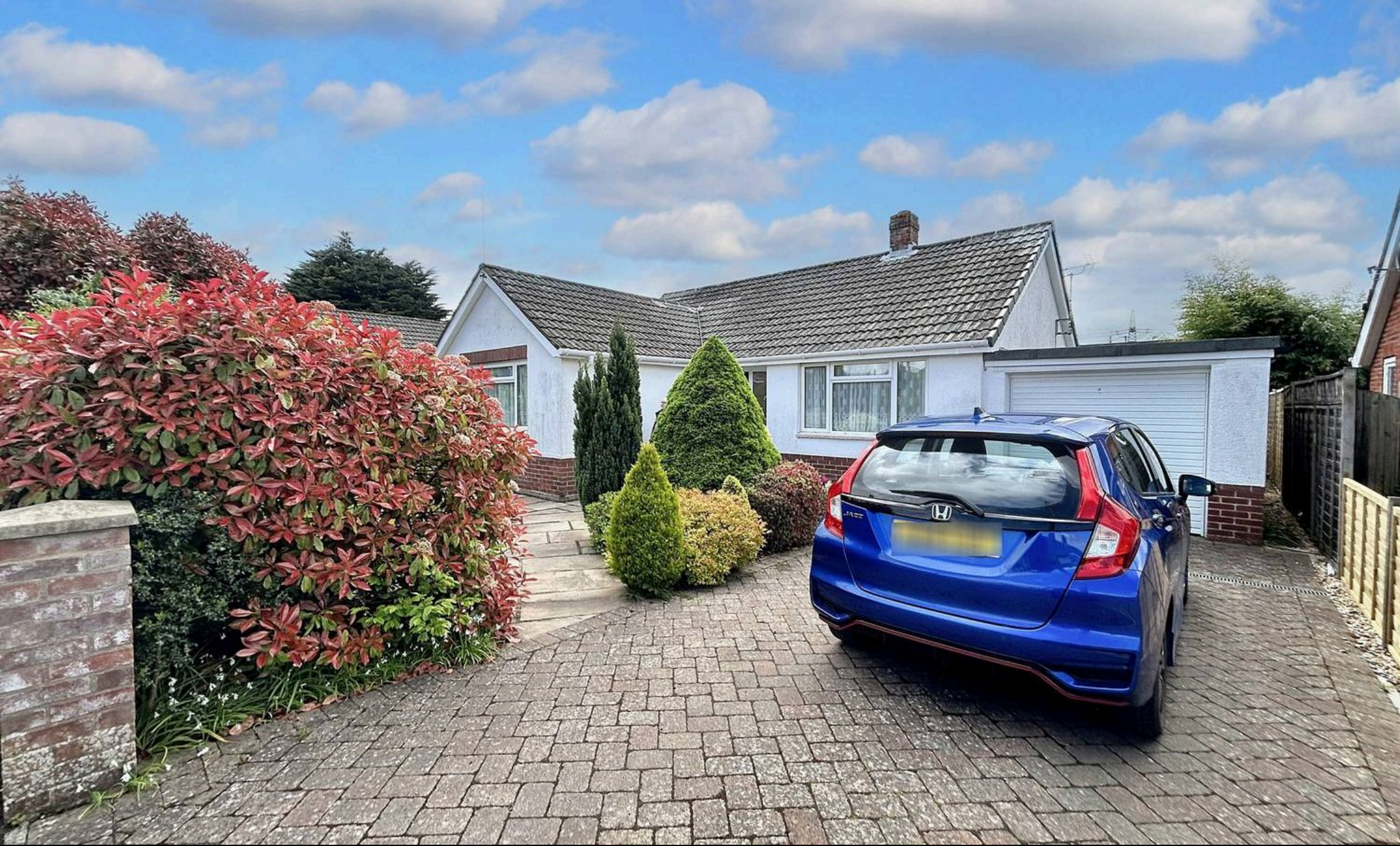
11 Oak Close, Dibden Purlieu £429,950