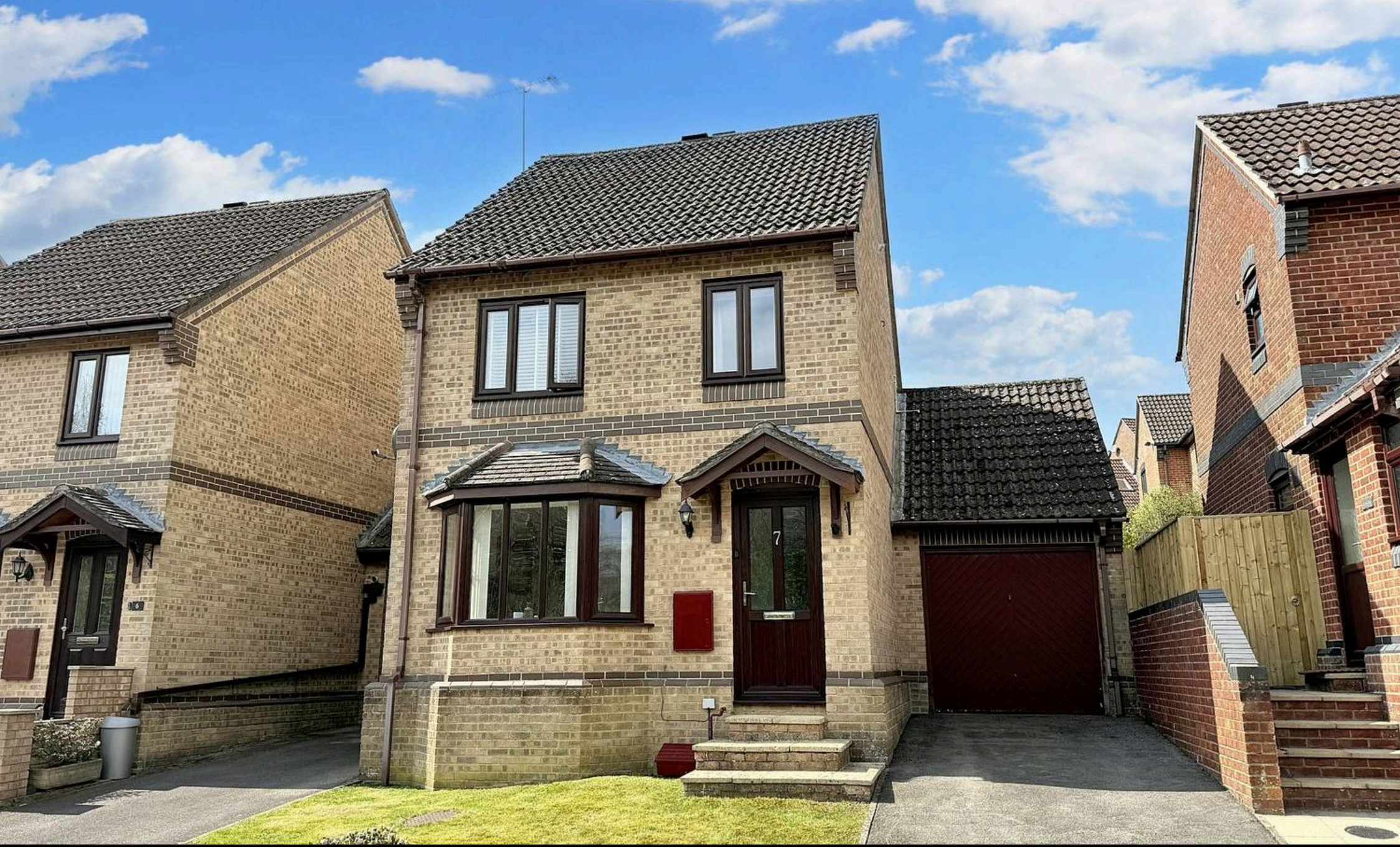
7 Briarswood Rise, Dibden Purlieu £379,950