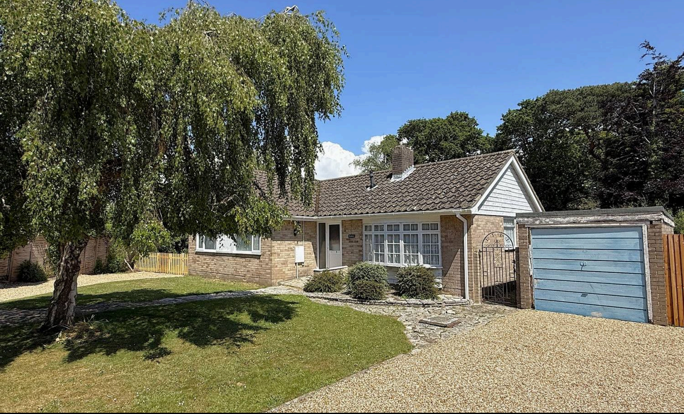
Woodlawn Stonehills, Fawley £465,000