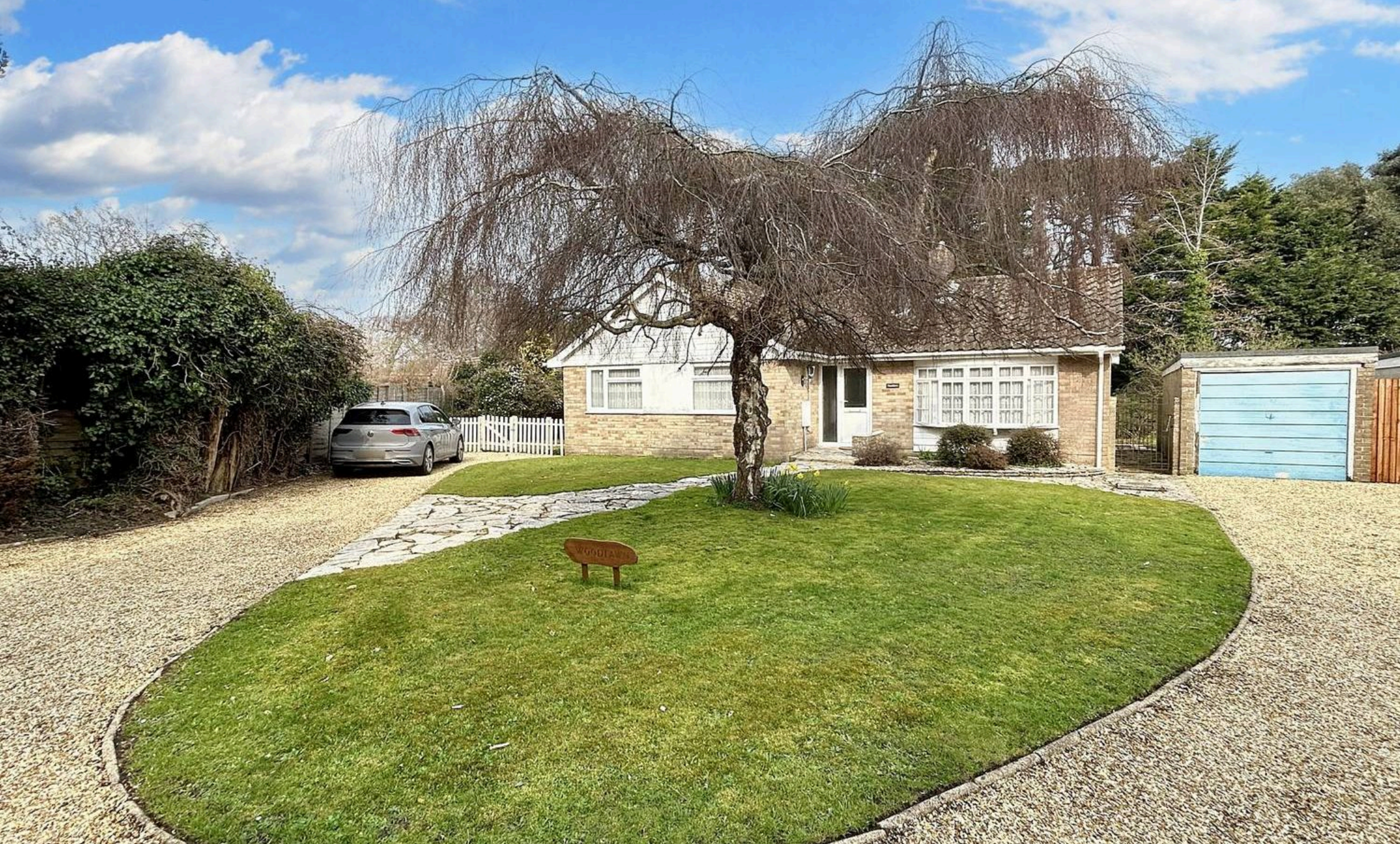
Woodlawn Stonehills, Fawley £495,000